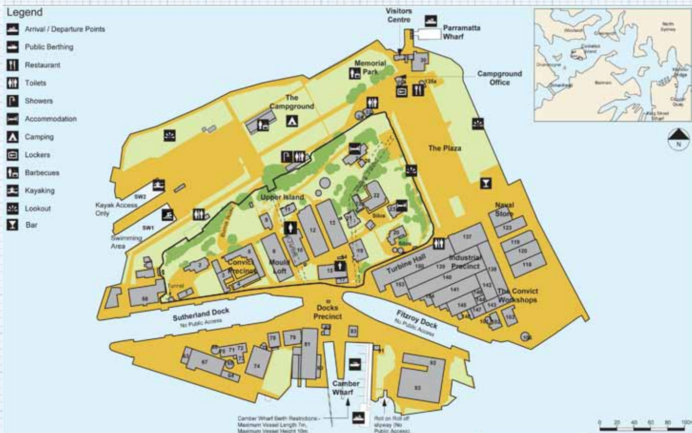
INSET MAP ON RIGHT: UNDERBELLY ARTS PRECINCT